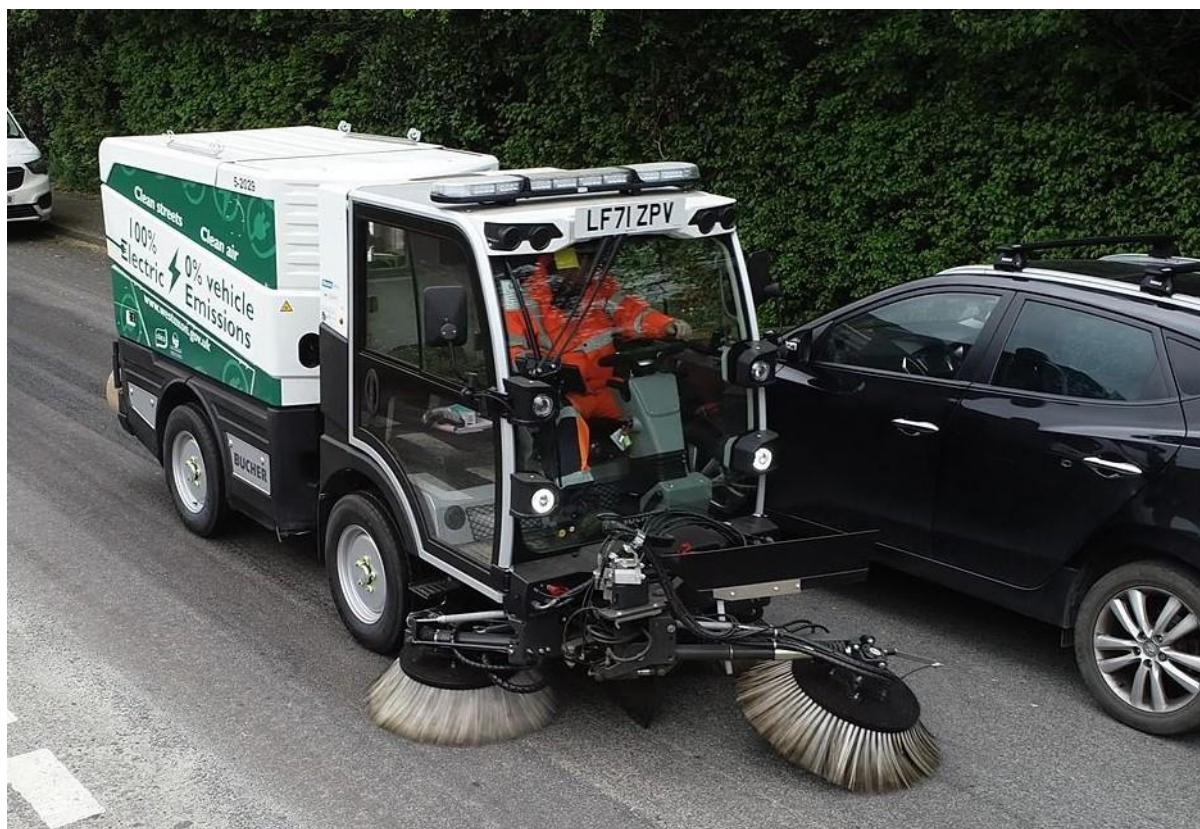
An electric sweeper

The Council has not invested into Ubico to generate a financial return. It has invested purely to support service provision. Ubico is a cost sharing company and any surplus generated within Ubico Ltd is returned to the partner Councils (shareholders) but any deficit would also be met by the Councils. This means that the Council's investment in Ubico carries with it an obligation to underwrite the costs of the service and that, while a budget is agreed each financial year, the Council must cover in cash any overspend to that budget which relates to the services delivered in West Oxfordshire. This is the material risk in the Ubico investment, not the £1 shareholding. This risk is being mitigated through regular communication with Ubico who are happy to give complete transparency. We are also working with them collaboratively on a service transformation programme to find new efficiencies and more cost effective ways of working.