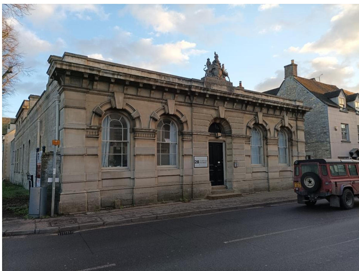
The Old Courthouse – Council owned temporary accommodation

It is permissible to purchase property for the purpose of regeneration or housing, and property purchased should be within the boundaries of the Council's area but any asset bought primarily for yield will preclude the authority from accessing PWLB funds.