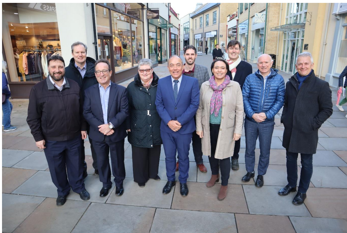
WODC Councillors and Officers in Marriott's Walk, Witney

In 2022/23, the Council has, among other things, replaced some waste vehicles, supported the delivery of affordable housing in the district, given improvement grants for the homes of residents with mobility challenges, supported local community capital initiatives, completed the rollout of high speed broadband, purchased a high profile local shopping centre and started work to upgrade the Council chamber with multi-media facilities which will allow meetings to be viewed and speakers to participate remotely.